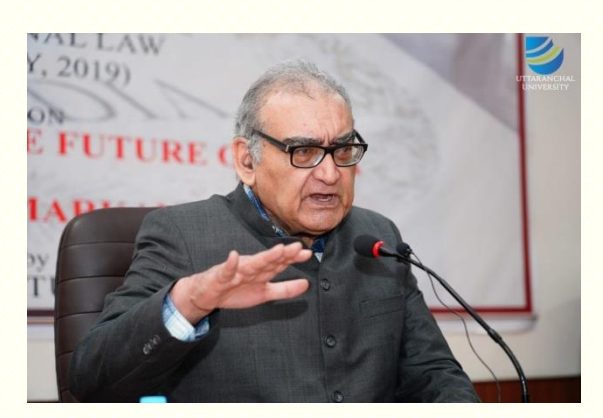
National Seminar on "the Future of Constitution in India"

The Seminar was ornamented bv Hon"ble Mr. Justice Markandey Katju, former judge of Supreme Court of India, comprising of his keynote address followed by interactive session. The National Seminar an overwhelming has seen with over 400 response participants from diverse fields. Further the session has also telecasted live via been Facebook for the followers of Justice Katju. The winners of the National Essay Competition on CONSTITUTIONAL LAW conducted by the Training & Recruitment Division of the College were also awarded therein.